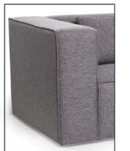
Arm - 25cm

Cushion Art. No.: 13676 38 x 75 cm (Buttons are available in other colour fabric)