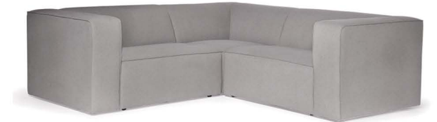
1,5 seater + corner 90 + 1,5 seater