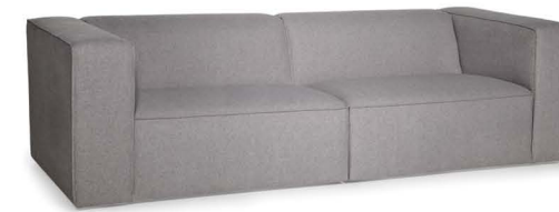
1,5 seater + 1,5 seater