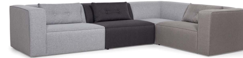
1,5 seater + 1,5 seater without arms + corner 90 + 1,5 seater