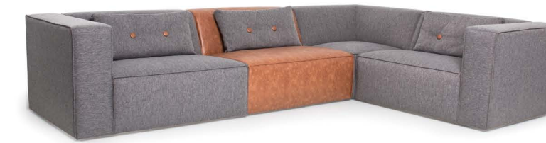
1,5 seater + 1,5 seater without arms + corner 90 + 1,5 seater